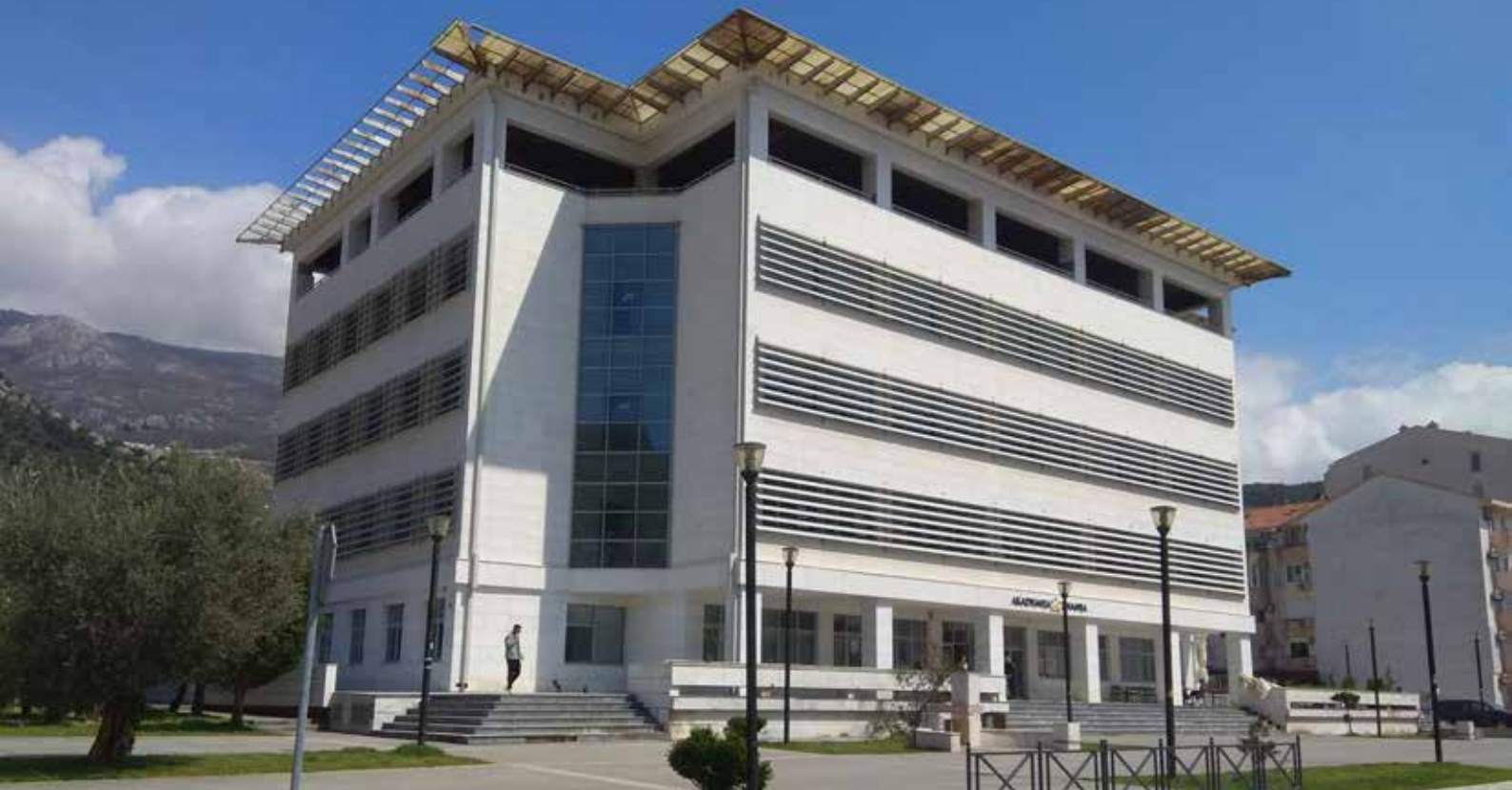
Conference Hall Budva (KC)